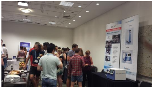
Presentation by the sponsor