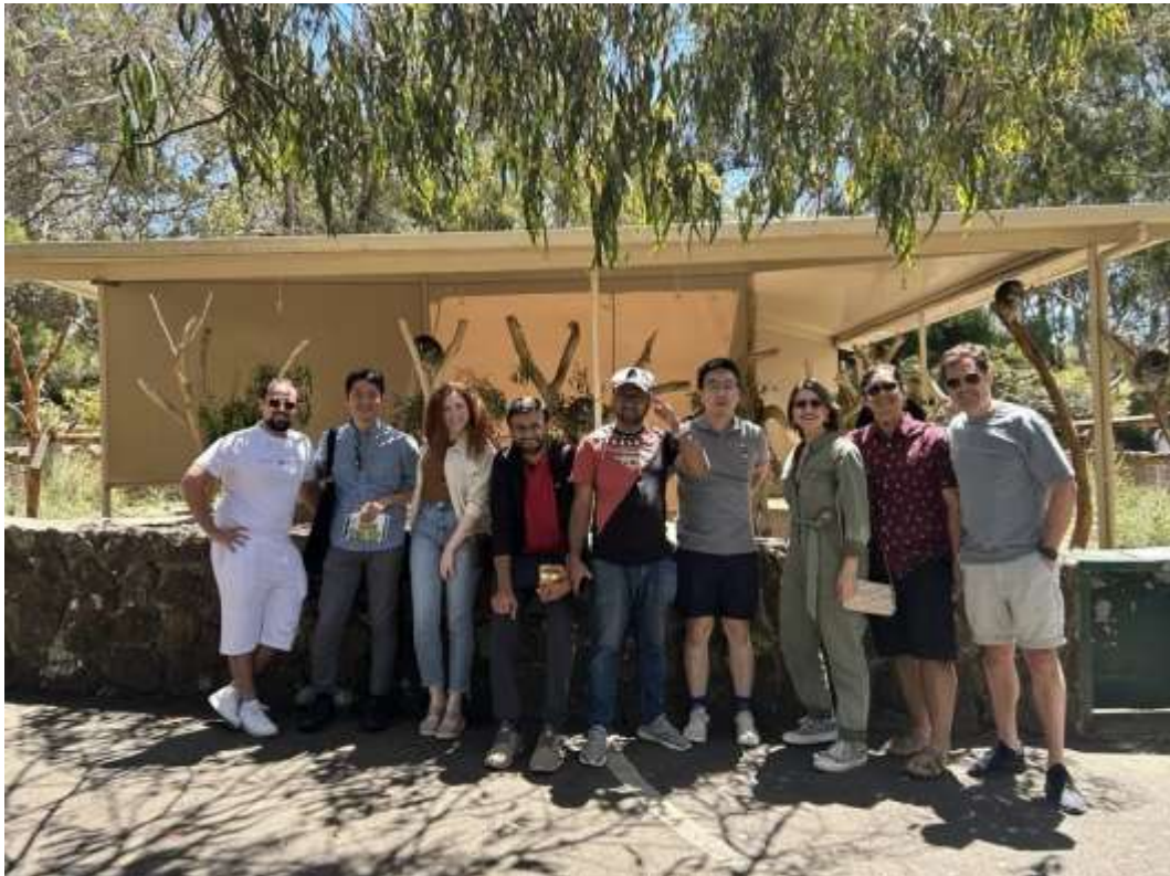
At Cleland Wildlife Park