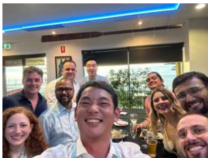
All International Members at Welcome Function