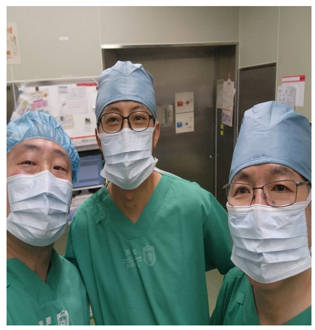
Pediatric urology team